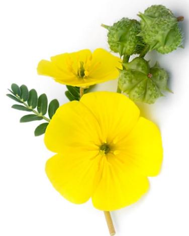
Tribulus terrestris (Gokshur) (Saponin 30%) : 130 mg

Stonil Capsule is an effective natural herbal remedy for complications related to Kidney problems such as Urinary Stone, Repeated stone formation, Urinary tract infection etc.