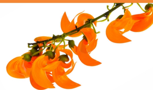
Butea monosperma (Palaspuspa) (Bitter 1%) : 40 mg