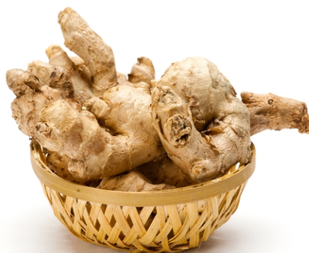
Zingiber officinale (Sunthi) (Gingerol 2.5 %) : 60 mg