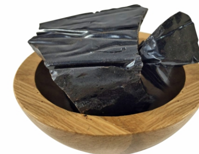
Asfoltum punjabinum (Shuddha Shilajit) ( Fulvic acid 2 %) : 20 mg