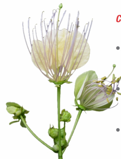
Crataeva nurvala (Varun) (Tanin 1 %) : 80 mg