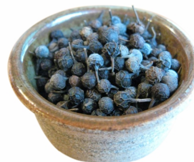
Piper cubeba (Kankol) (Bitter 1%) : 35 mg