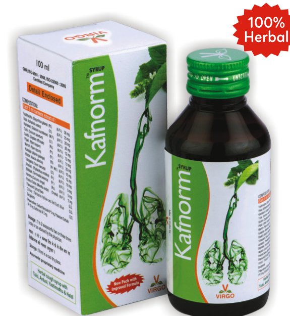
Safe, Effective, Standardized Ayurvedic Medicine